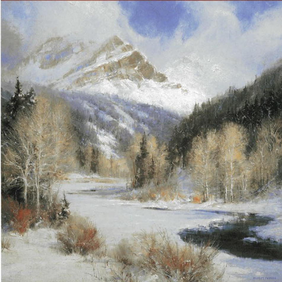
Winter's Allure oil 30" x 30"

May 28 – May 31 · Artist Appearance May 29, 1 pm to 5 pm